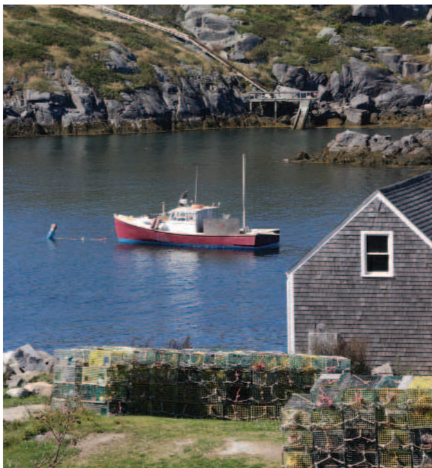
The solid granite Monhegan Island Light (opposite, inset), rebuilt following storms that inflicted heavy damage on the original 1824 station, towers 48 feet above the island—including the Blackhead cliffs (opposite) and the harbor (above)—to help sailors navigate the Maine coastline.

The only way to get to this island, lying 10 miles off the coast of Maine, is by boat. Three passenger-only ferry lines carry people daily in high season, roughly June through August, while one line operates all year. Getting there is easy and fun.